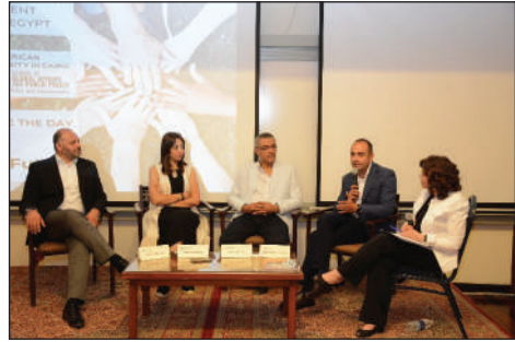
Plenary session on youth training programs