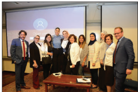
The research team