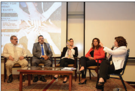
Plenary session on youth job placement programs