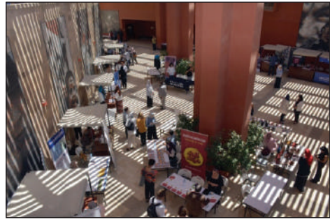
A view of marketplace setup