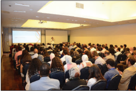
Session by JPAL on program monitoring and evaluation