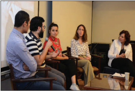
Plenary session on youth entrepreneurship programs